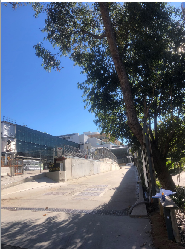
Photograph 3- View looking into second entrance point from McLaren Street and Lot 1 DP 536008 in the background.