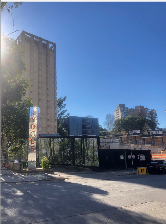
Photograph 4- Adjacent site, Rydges Hotel and adjacent construction site.